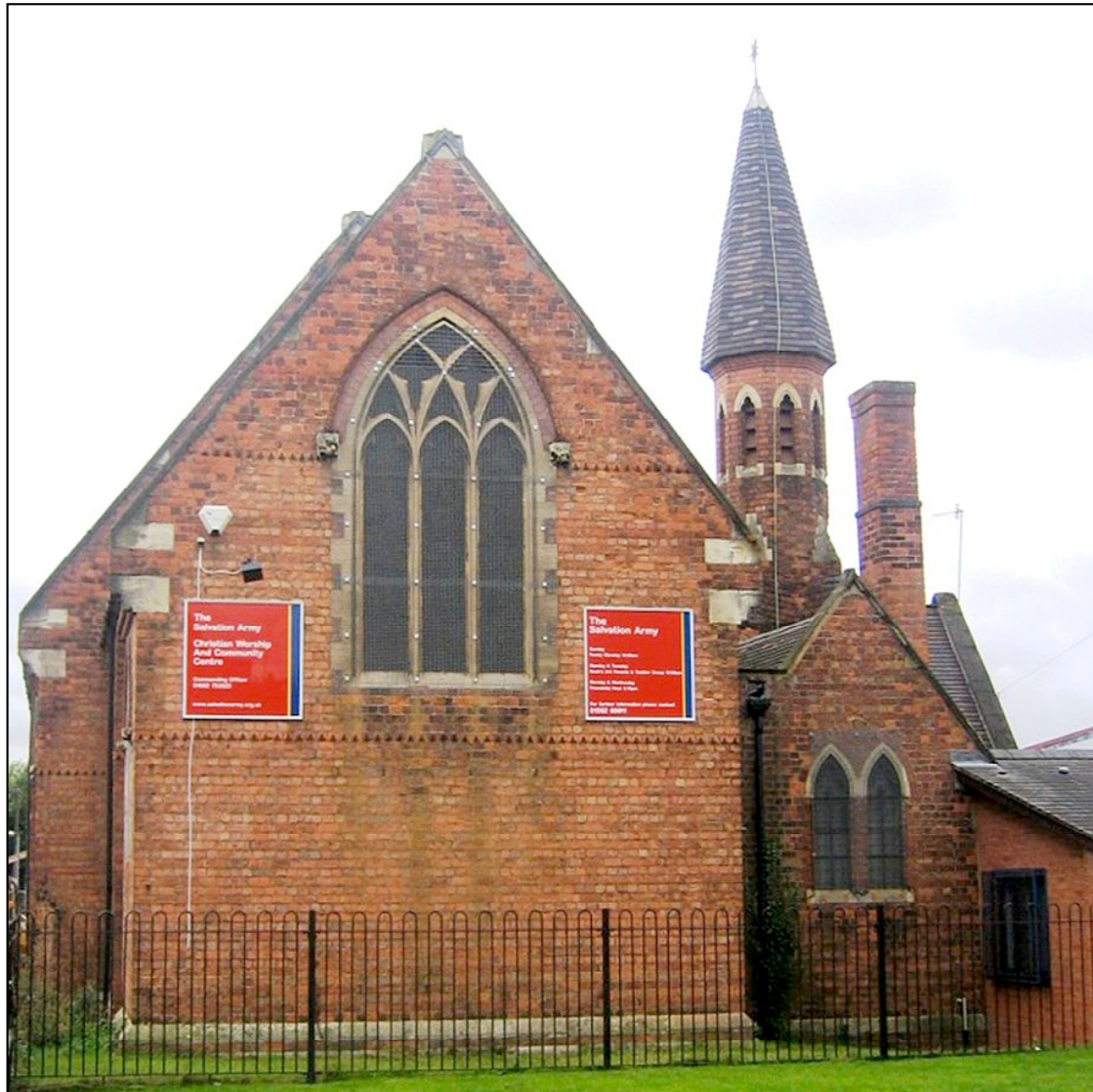
St James's Church, Horsefair - Rear view (Mattie Underhill 2004)