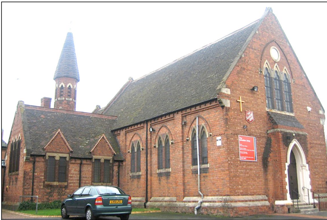
St James's Church, Horsefair – Front/Side view